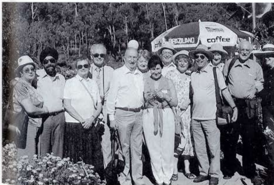
Members of the Royal National Rose Society at Melville Rose Nursery, Carmel, W.A. - Spring '99.